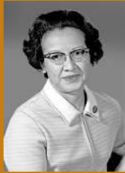
Katherine Johnson Mathematician